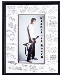
16 x 20 Signature Board

We will mail complete information in the spring Dozens of Grad Card designs available Order at least 4 weeks before your open house (requires an appointment)